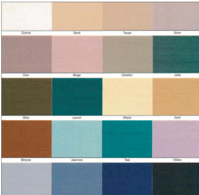
The Dynasty collection by Framing Fabrics includes a set of 44" wide, 100 percent pongee silk fabrics. Colors range from neutral tones to bright and deep jewel tones.

more beautiful than a custom wrapped mat."