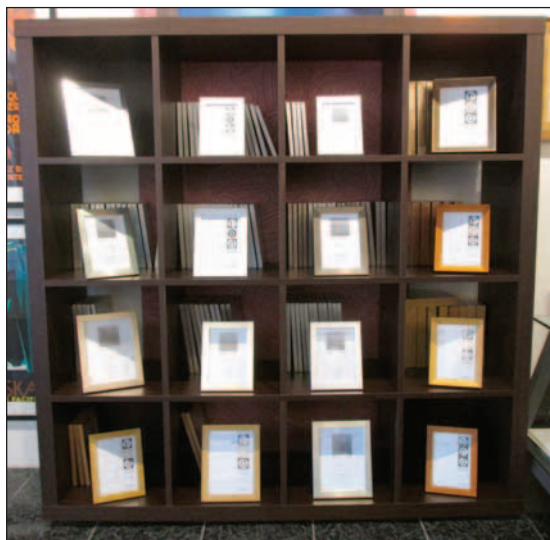
Frame Up Quality Picture Framing in Mornington, Australia, has a basic display stand in the front of their stores, stocked with ready-made frames to cater to all customers.

Merchandised displays for ready-made frames should always look neat and logically organized, but not over-stocked. If a display is too full, customers may assume that no one else is buying them. Having a few items missing can visually convey the message that others have been buying. Comfortably space out your frames so your display doesn't look too cramped or too mass-merchandised. You can also make