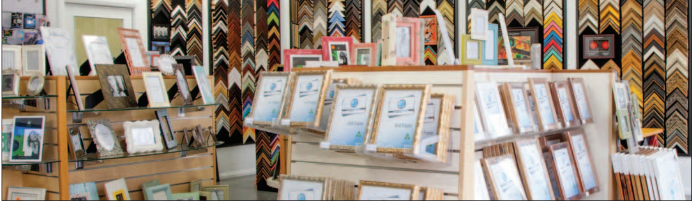
Top Shot Photographics in Goulburn, Australia, successfully offers both custom-framing and a wide variety of ready-made frames.

frame and order a photo printed to suit rather than struggle to find a frame for a photo that has already been printed.”