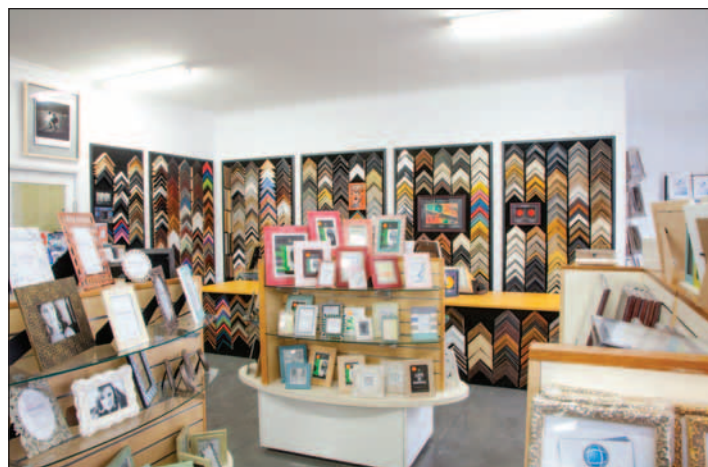
Top Shot Photographics has positioned its ready-made frame display gondola close to the custom-framing area to increase awareness of custom-frame alternatives.

When it comes to selling, most of the battle is providing customers a convincing reason to come into your store. So