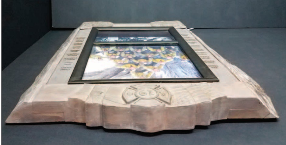
Juniper wood was incorporated into the frame design to represent how the Granite Mountain Hotshots were known for protecting the area's indigenous juniper trees—a 9" wide slab of recovered wood was used to construct a lap-joined, 18"x21" frame.

Also, hand-carved at the bottom is the Latin phrase,