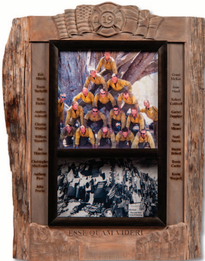
The core elements of the frame design commemorate the Granite Mountain Hotshots and their mission, including the choice of juniper wood and the representation of the eternal flame.