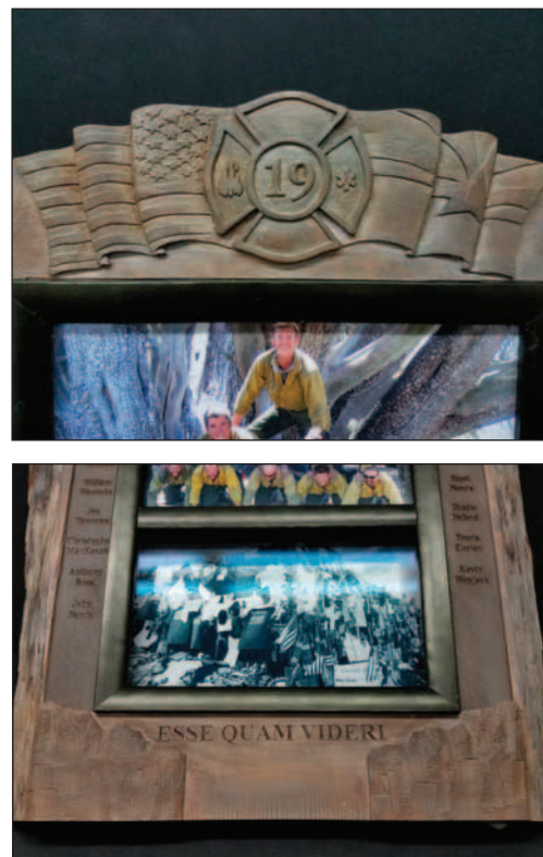
A Larson-Juhl frame, Ferrosa Iron, was attached to the piece from the back with L-brackets. This frame can be easily removed, and the engraved pieces on Optium Museum Acrylic can be slid out to access the light channel. The entire frame is covered with a lacquer spray for preservation, and the photos are glazed with Optium Museum Acrylic.

“Esse Quam Videri.” The English translation is, “To be, rather than to seem,” which conveys the Hotshots' commitment to their mission.