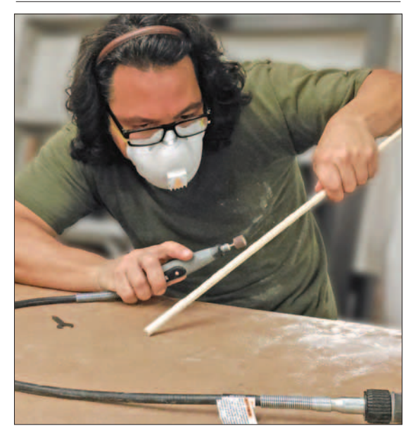
Using a Dremel tool to carve faux bamboo rods from poplar dowels.