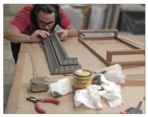
Checking the gap on the double stacked moulding that creates the roof of the tea house.