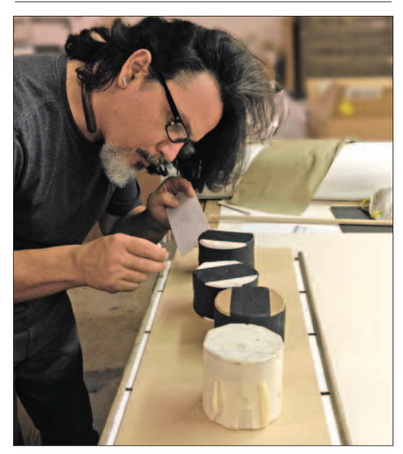
Bonding the scrolls to the fabricated faux bamboo rods.

to convert the four images into miniature scrolls in a Japanese style, thus elevating them into tangible three-dimensional objects rather than two-dimensional images.