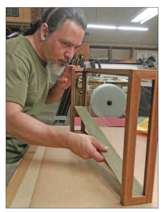
Constructing the ceiling and floor panels of the tea house from 8-ply rag and silk fabric.

The beauty of these four artwork prints from the perspective of conservation is that they are small, flat, and printed on a reasonably firm substrate. That made handling quite easy. The real work was in the preparation of the panels on which they are attached. Each scroll panel is made of a layer of Jewel silk bonded to 1-ply rag board. The preferred adhesive in this case was pHneutral fabric adhesive from Frank's Fabrics. This was used to give the fabrics a firmness before cutting them