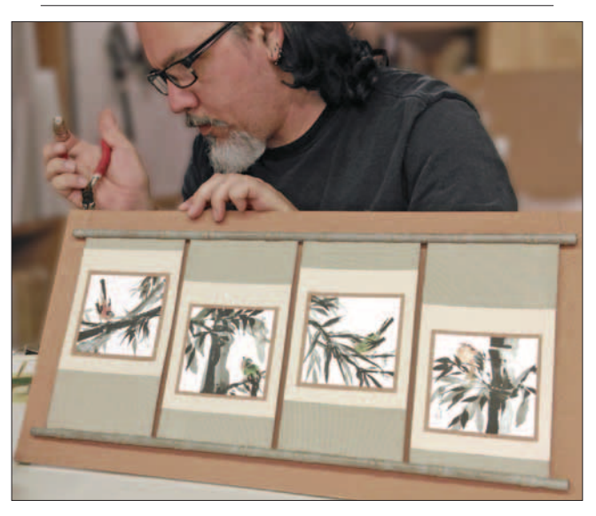
Attaching the scroll with filament to the backing, which is also constructed from 8-ply rag and Jewel silk.

into sections for inlay. Once each inlaid piece was cut, they were assembled like a puzzle on top of a 2-ply rag board. The artworks simply fit over the finished panel with a 1-ply rag barrier between.